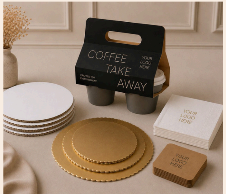
Coffee Accessories & Bakery Essentials

Designed for everyday operations where reliability matters most.