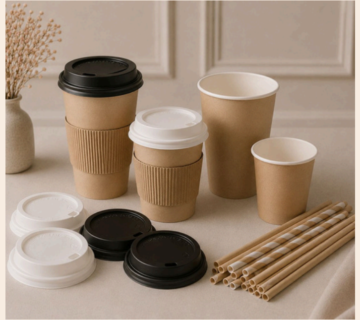
Paper Cups, Lids, Sleeves & Straws