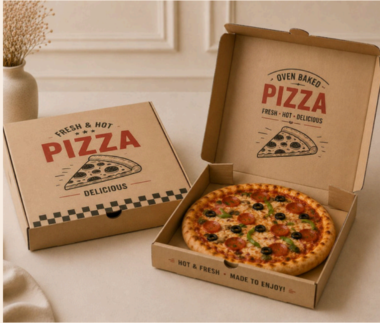
Kraft Pizza Boxes

Built for daily operations, takeaway convenience & repeat use