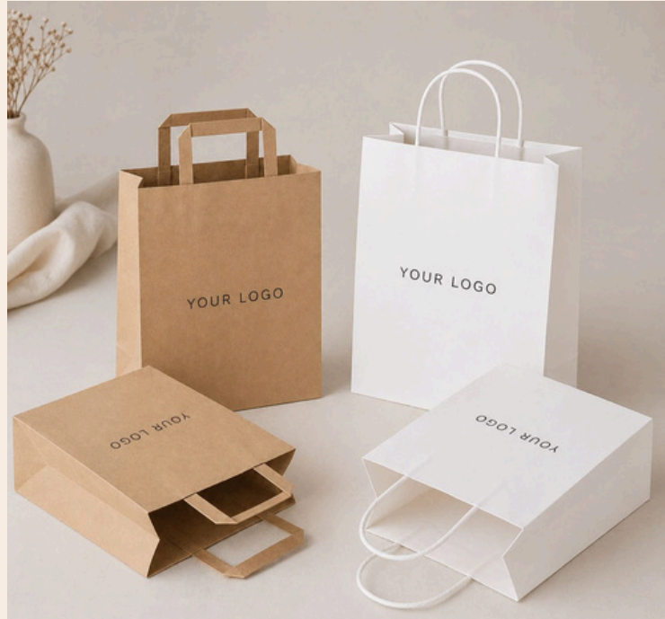
Paper Bags (Flat and Twisted Handle)

Built for efficient takeaway, delivery and food handling