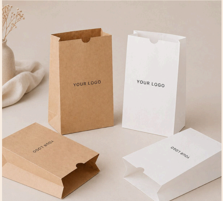
S.O.S Paper Bags (Takeaway)