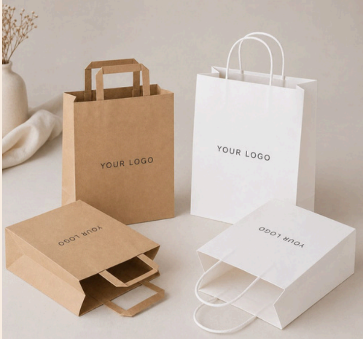
Paper Bags (Flat and Twisted Handle)

Built for efficient takeaway, delivery and food handling