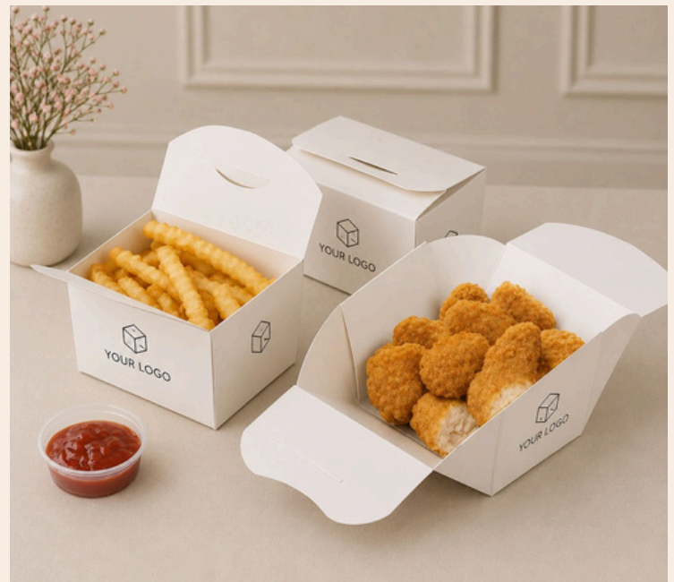
Fries & Nuggets Box

Customizable across sizes, paper grades & printing - built for repeat operational use