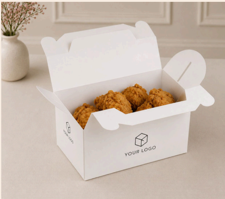
Fried Chicken Box (With Handle)