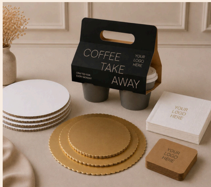
Coffee Accessories & Bakery Essentials

Designed for everyday operations where reliability matters most.