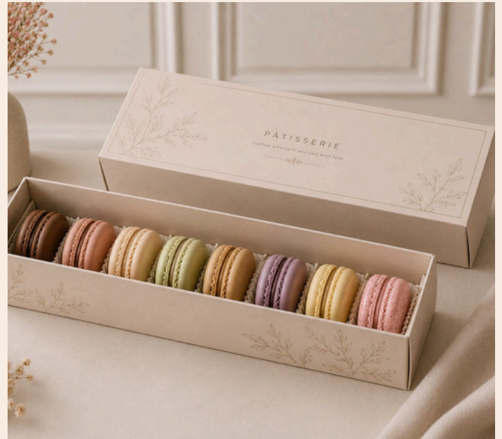
Premium Macaron Box

Crafted for memorable moments. Designed to elevate every experience.