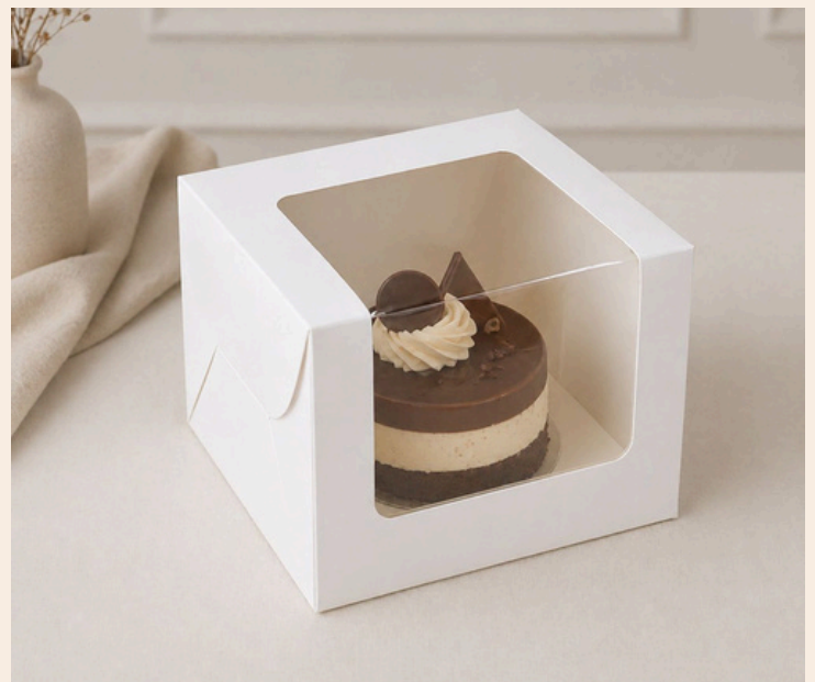
Pastry Box (Single Serve)

Fully customizable to match your product range, branding & operational needs