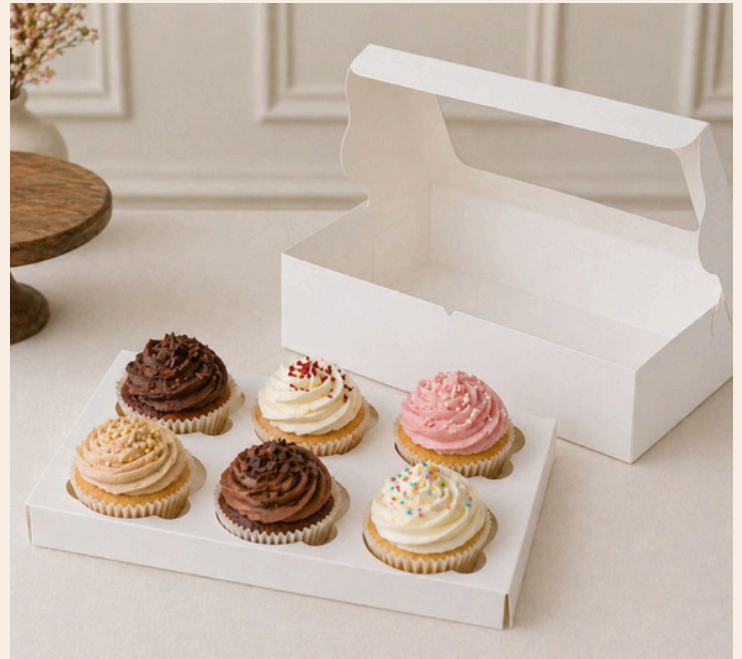
Cupcake Box with Insert