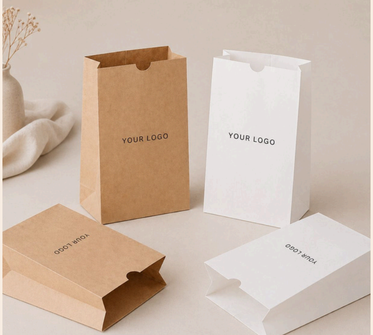
S.O.S Paper Bags (Takeaway)