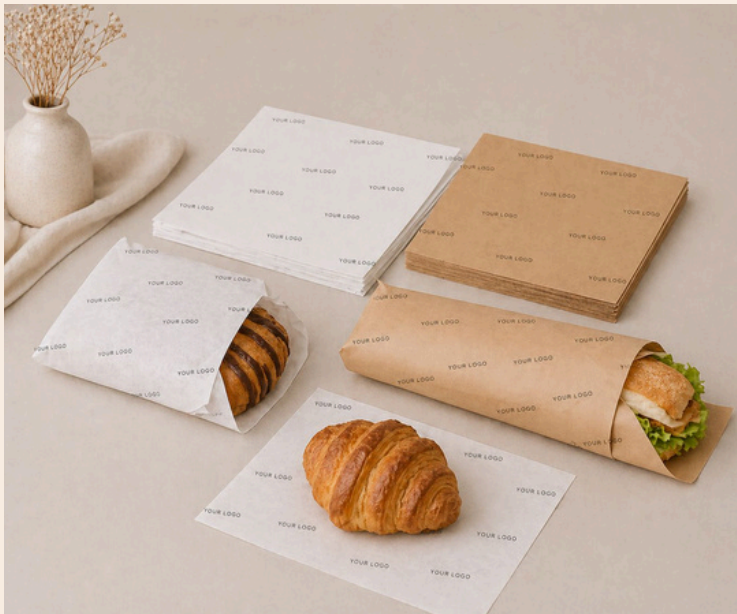
Food Wrapping Paper (Grease Resistant)