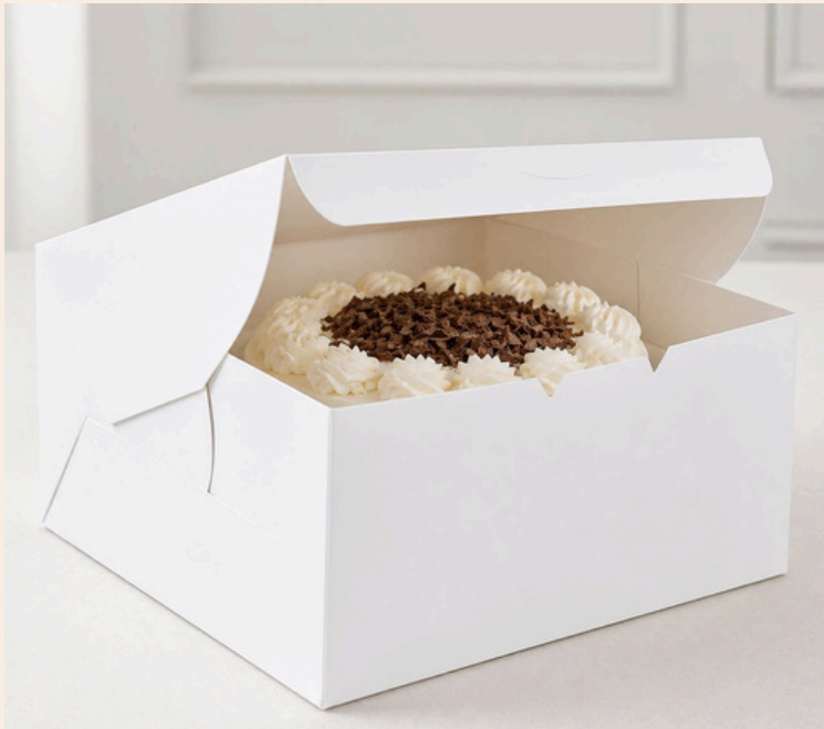
Cake Box (Window)

Designed for product presentation, protection & brand experience