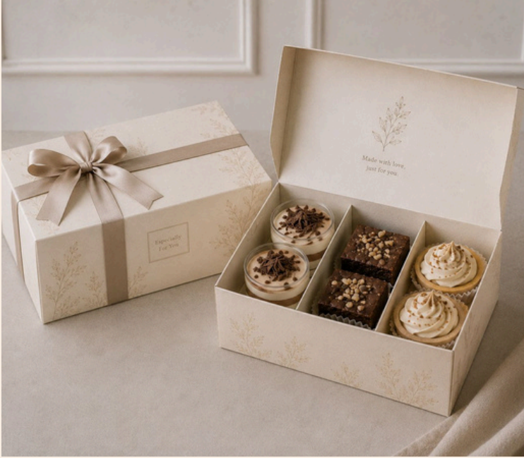
Premium Dessert Gift Box

Designed for elevated presentation, gifting & niche food concepts