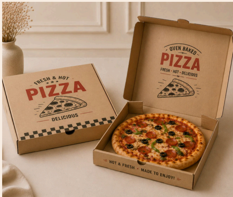
Kraft Pizza Boxes

Built for daily operations, takeaway convenience & repeat use