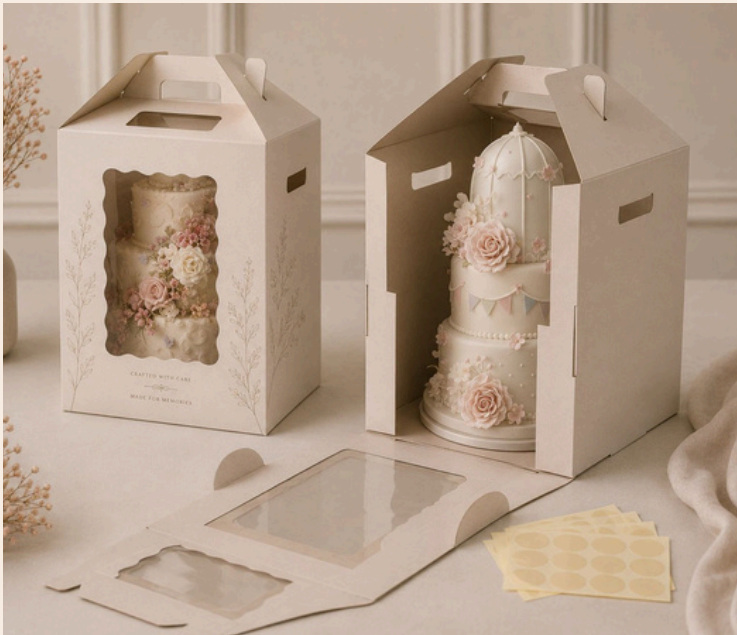
Tall Cake Box