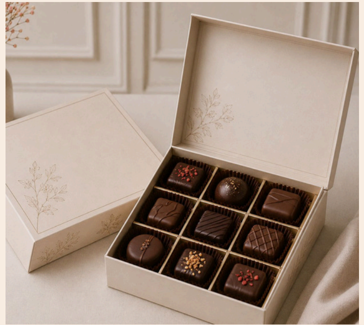
Premium Chocolate Box