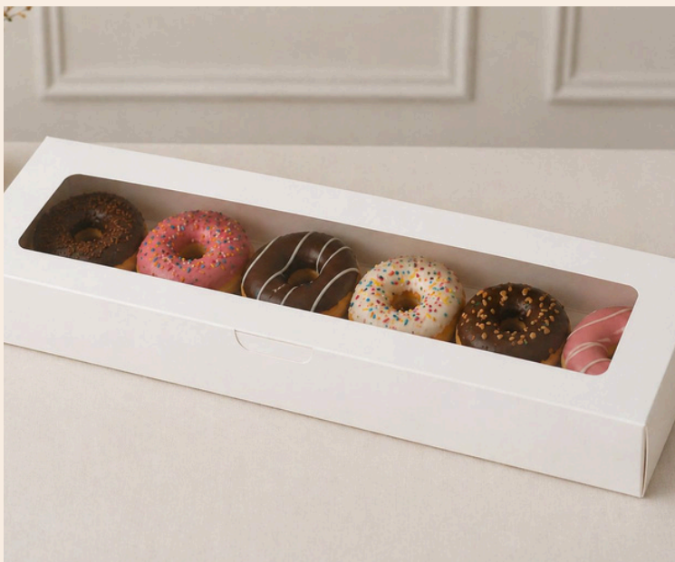
Donut Box (Long Window)