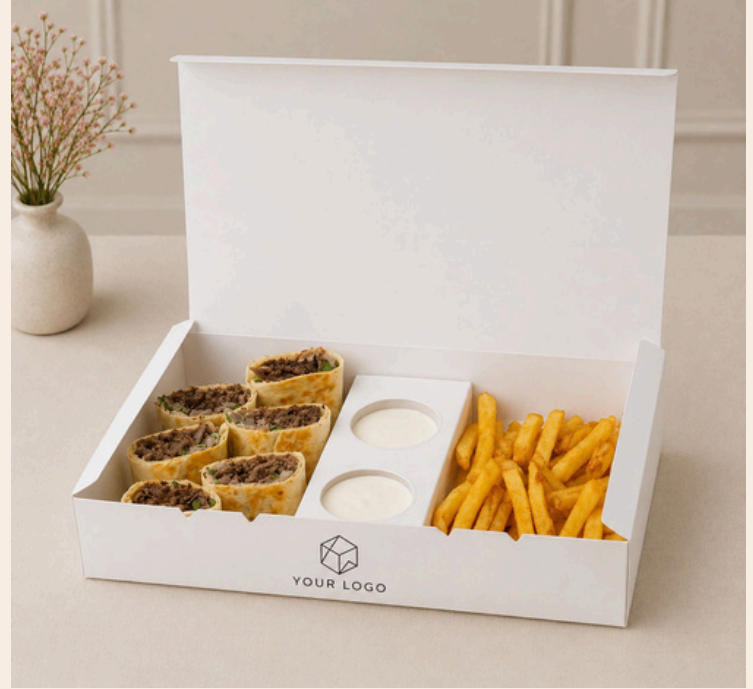
Shawarma Meal Box (with Tray Insert for Dips)