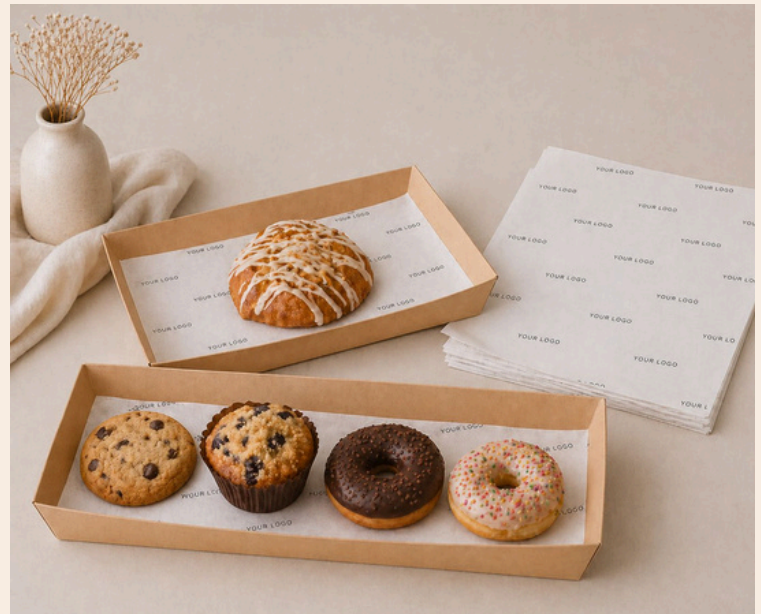
Tray Liners (Food Grade & Absorbent)

Customizable across sizes, paper grades and printing - optimized for daily use