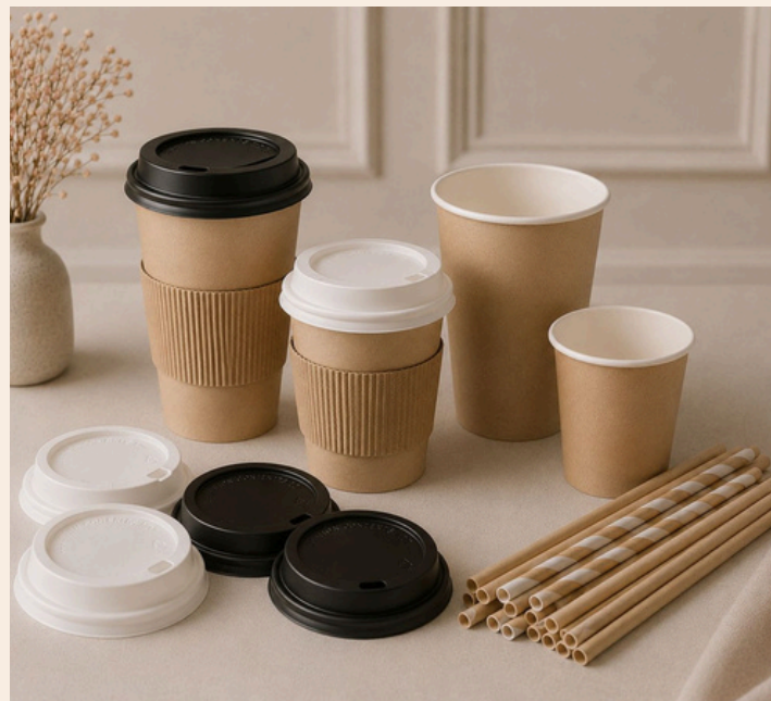
Paper Cups, Lids, Sleeves & Straws