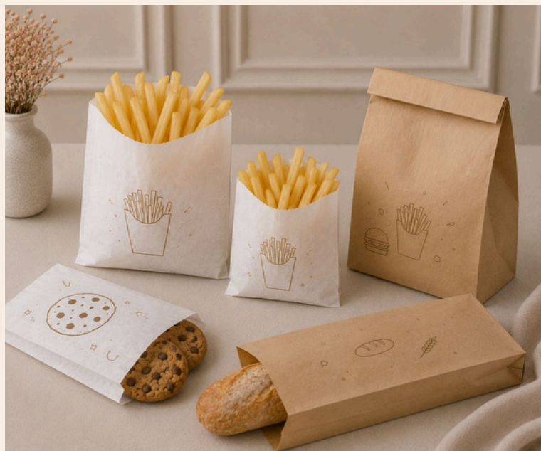
Fry Pouches & Bakery Bags