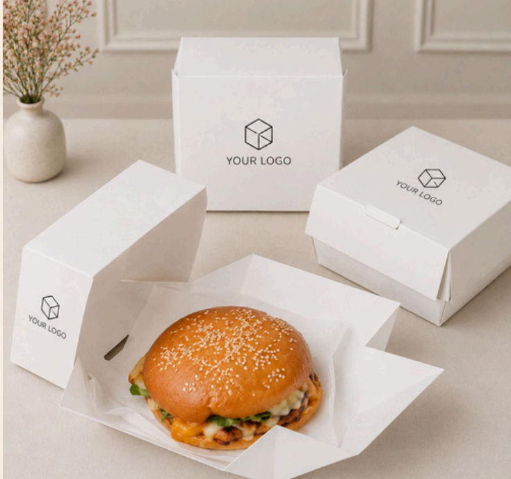
Burger Box (Die Cut Style)

Designed for takeaway, delivery & fast-moving foodservice operations